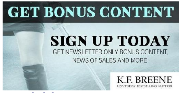
Click here to sign up.

Reviews are like hugs - sometimes awkward, but always appreciated {<}3